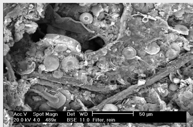
REM picture of a depth filter sheet: round/disc-structures are DE particles, long structures represent cellulosic fibers

Sheets with an ash content > 1 contain diatomaceous earth (DE/«Kieselguhr») or perlite as an inorganic filter aid. FILTRIX uses only natural kieselguhr with a cristobalite content < 1 % (detection limit).